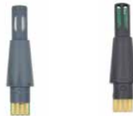
Hygrostick part number POL4750, for high moisture applications.