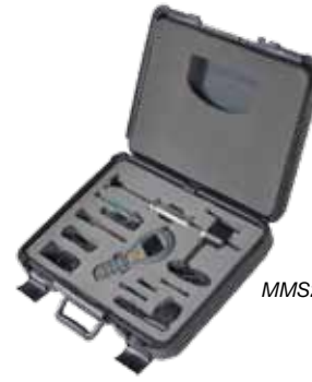
MMS2 Hard Carry Case Kit

Accuracy at 77°F (25°C) +/- 1.3°F (0.7°C)