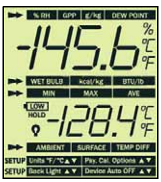
Figure 2: Full Screen Display

retractable probe and press the \bigcirc (ON) button. The LCD screen briefly flashes, similar to Figure 2 below. After a few seconds, the meter changes to measurement mode and displays only the currently selected parameters, as shown in Figure 3 on the next page. Moisture readings appear at the top, with temperature measurements below.