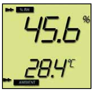
Figure 3: Typical Screen Display During Operation